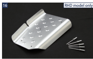
16 JAOS FOOT REST DRIVER ■ 2mm thick Aluminum, Anodized finish RHD model only