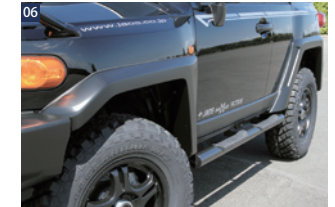
06 JAOS FENDER FLARE ■ Unpainted FRP ■ Width : 9mm