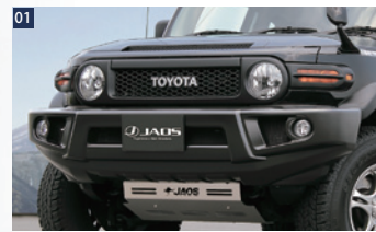
01 JAOS FRONT SPORTS COWL ■ Unpainted FRP ■ Fog lamps & Skid plate are not included

FJ CRUISER TIRE : YOKOHAMA GEOLANDAR M/T+ 285/70R17 WHEEL : VICTRON ASTELLA CM-02 POLISH / BLACK © Photo shown with BATTLEZ SUSPENSION SET VECA(50mm lift), JAOS FENDER FLARE and WHEEL SPACER (25mm)