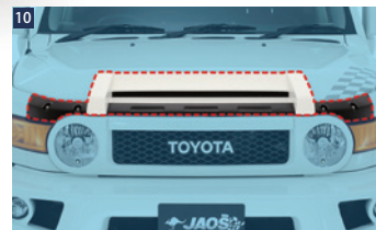
10 JAOS BONNET GARNISH ■ Unpainted FRP