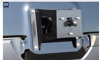
09 JAOS SPARE TIRE BRACKET ■ Black powder coated steel ■ Accommodate with genuine camera