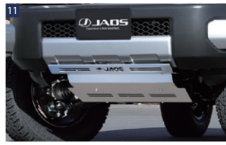
11 JAOS SKID PLATE 3 ■ 2.5mm thick SUS304, Shot blasted finish ■ Accommodate with genuine bumper