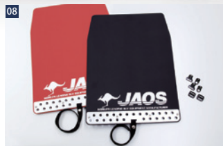
08 JAOS MUD GUARD3 UNIVERSAL L-SIZE ■ Available in Red or Black ■ EVA sheet x2, Aluminum hanger plate x2, Hanger belt(Nylon) x2 ■ Required 2sets with MUD GUARD BRACKET