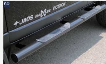
04 JAOS BLACK SIDE STEP ■ Black powder coated 76.2mm SUS304 tube, resin step board