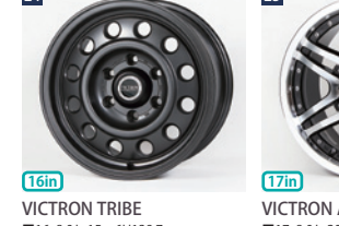
24 ■ 16x8.0J+15 6H139.7 ■ Matt-Gunmetallic ■ Cast 1pc, Center cap is included ■ JWL / JWL-T / VIA