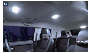
14 JAOS LED ROOM LAMP ■ Set includes: FRONT+CENTER+REAR ■ Tptal 48LED (Approx. 3.8W)