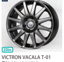
26 ■ 20x8.5J+18 6H139.7 ■ Shadow Silver ■ Cast 1pc, Center cap is included ■ JWL / JWL-T / VIA