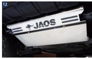
12 JAOS SKID PLATE TYPE R ■ 4.0mm thick AS052 ■ Include: JAOS logo sticker