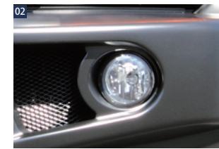
02 987 FOG LAMP SET ■ Fog lamps (Clear lens/H11 Halogen bulb/55W/12V) x2, Wiring kit