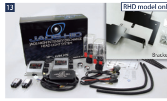
13 JAOS HID HEAD LIGHT KIT 2 6000K H4SD ■ HID Bulb : H4Dual(Hi/Low) 6000K (Made in Japan) ■ HID ballast : inverter+igniter ■ Bracket : Stainless Steel RHD model only