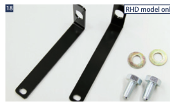
18 JAOS BACK LAMP BRACKET FOR TF-4 ■ Accommodate with BATTLEZ TF-4 exhaust ■ RHD model only RHD model only