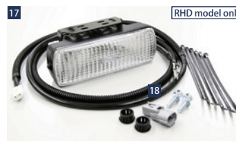
17 JAOS BACK UP LAMP SET ■ Back lamp(Clear lens/H3 Halogen bulb/35W/12V) x1, Wiring kit, Bracket ■ RHD model only RHD model only