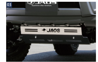
03 JAOS SKID PLATE FOR FRONT SPORTS COWL ■ 2.5mm thick SUS304, Shot blasted finish ■ Accommodate with JAOS FRONT SPORTS COWL