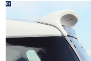
05 JAOS ROOF SPOILER ■ Unpainted FRP