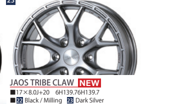
22 ■ 17x8.0J+20 6H139.76H139.7 ■ 22 Black / Milling ■ 23 Dark Silver ■ Cast 1pc, Center cap is included ■ JWL / JWL-T / VIA