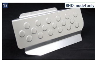
15 JAOS FOOT REST PASSENGER ■ 2mm thick Aluminum, Anodized finish RHD model only